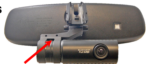
SPRING CLIP HORIZONTAL ADJUSTMENT SCREW

4 - Using the upper and lower pivot screws, adjust the mount to achieve your desired location of the dashcam. We recommend adjusting it as high as you can. You can also use the spring clip horizontal adjustment screw to help center the dashcam with the mirror as shown above.