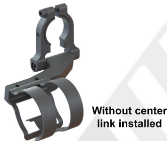
Without center link installed

3 - The center-link may be removed if an overall shorter mount length is needed, depending on your rear view mirror and desired position for the dashcam.